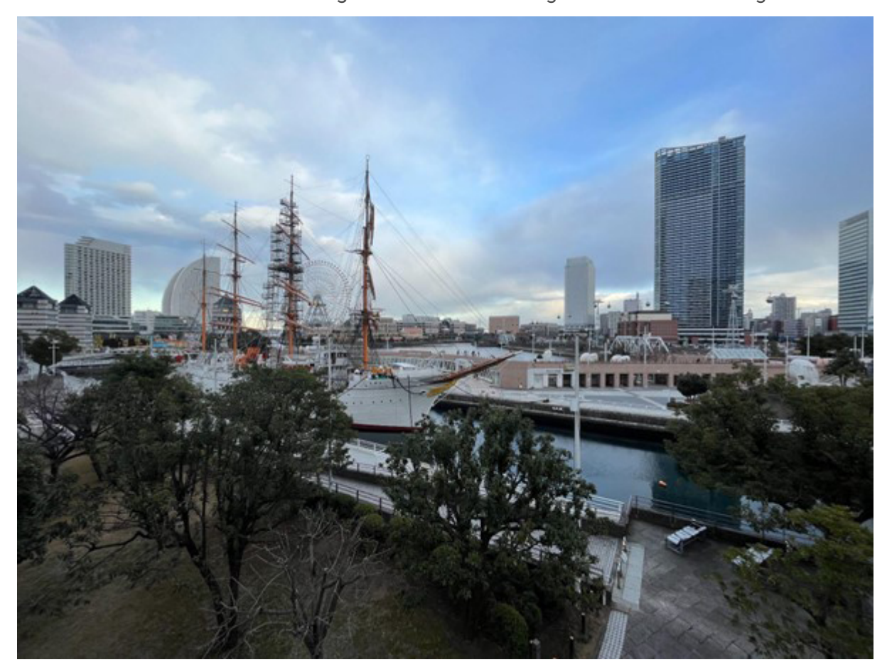
Figure 2 - Photo of the Yokohama Port Museum

Though the staff at the Marine Science Museum had at one point hoped for a three-story building with a basement (YOKOHAMA KAIYŌ KAGAKU HAKUBUTSUKAN, 1984, p. 71), the Maritime Museum was ultimately built with one aboveground and one underground level to