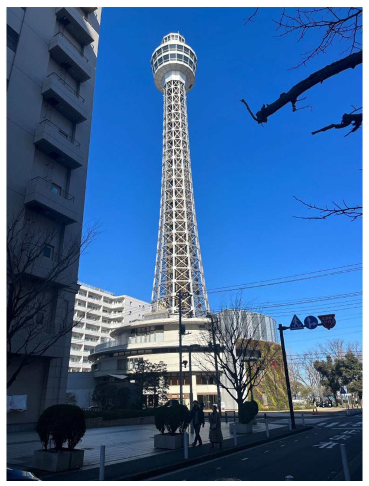
Figure 1 - Photo of the Yokohama Marine Tower