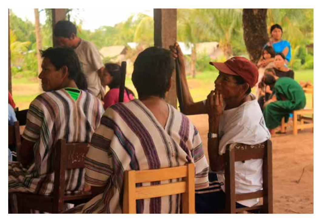
Figure 1 - members of the Self-Defense Committee of the Potsoteni community carrying their weapons, 2017.

community, members of the Peruvian armed forces patrolled the area of Potsoteni. The presence of the Army in the communities is part of an attempt by the Peruvian State to combat drug trafficking since the region (the VRAEM,<sup>6</sup> as it is called) is also the place where most of the plantations that supply the narcotraffic on a continental scale are concentrated. Until today it is also usual to observe the members of the self-defence committees, wielding their weapons in the communities, not without a certain pride and symbolism. The indigenous armed groups continue to exist legally as a guarantee of territorial vigilance (see figures 1, 2 and 3).