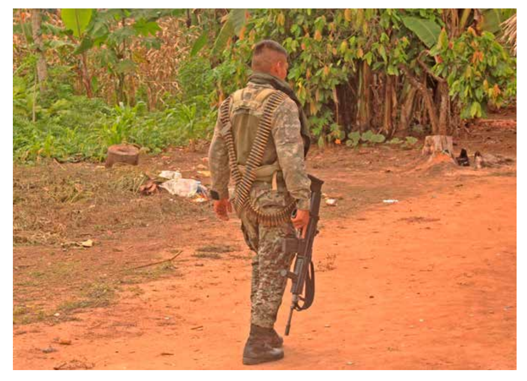
Figure 3 - Military of the Peruvian army patrolling the Potsoteni area, 2017.